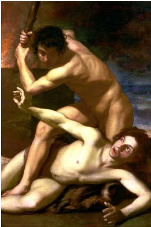
Bartolomeo Manfredi

'Cain Murdering Abel,' Bartolomeo Manfredi, c. 1610